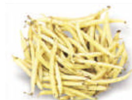
Yellow wax beans.

AgriExotic Trading 280 Wilson Avenue Newark, NJ 07105